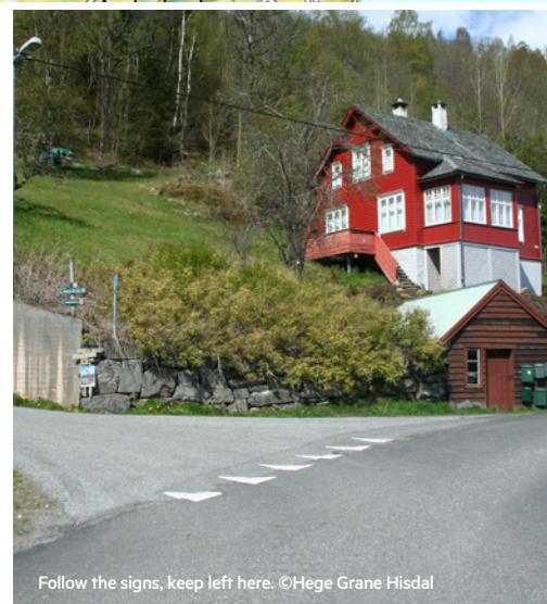
Follow the signs, keep left here.

Walk from Ulvik centre towards the camping site, up past Skeie. Follow the yellow circular sign past "Daudebakken" through a farm yard, onto a paved road past Spånheim, then a gravel path for a while, before a forest trail to Børsheim. You will pass several spring and summer pasture farms. On the way, you will find poems by Olav H. Hauge (in Norwegian). Partly steep. At some places there are ropes that can be used to pass difficult areas. The trail is used for the annual and very popular uphill running competition called "Kvasshovden opp" in mid-July. The view from the top is more than breathtaking!