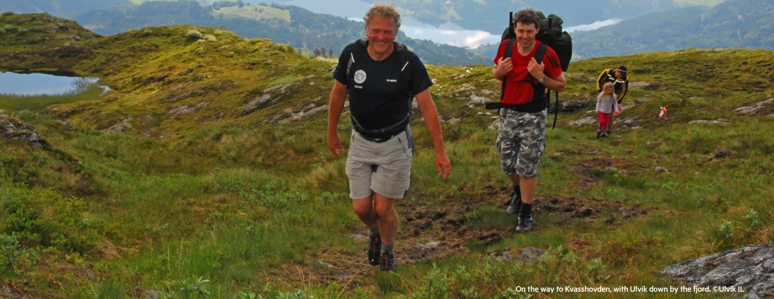
On the way to Kvasshovden, with Ulvik down by the fjord.