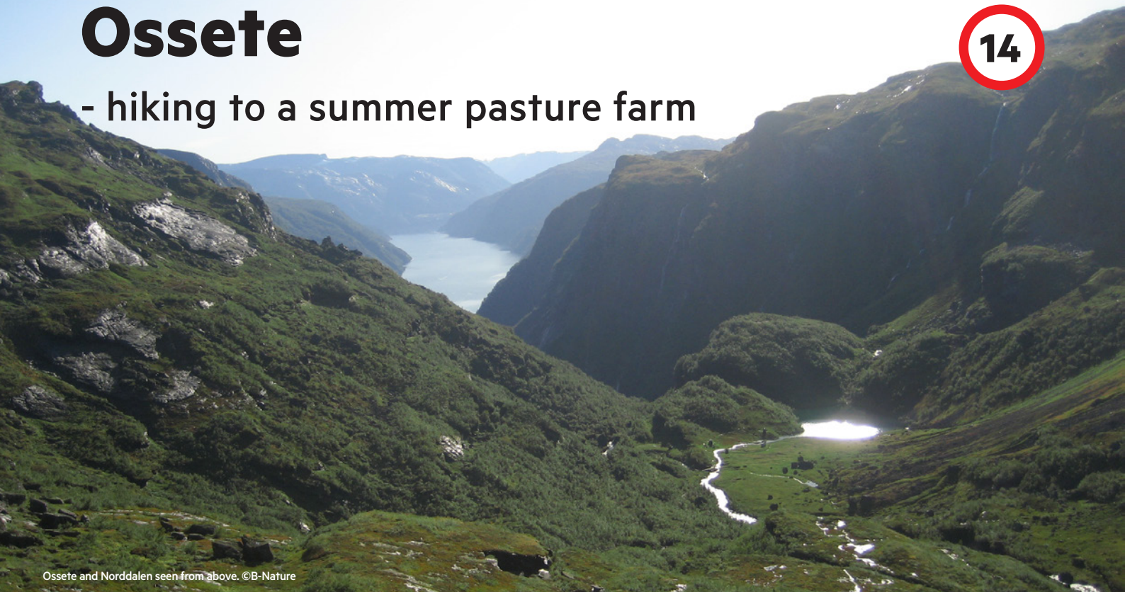
Ossete and Norddalen seen from above.