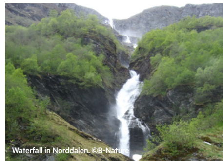
Waterfall in Norddalen.

Ossete means “summerfarm for Osa”. Challenging walk, steep but rewarding. Marked trail from Osa through Norddalen (the north valley). Some very steep parts, slippery when wet. Breathtaking views down the valley, with the waterfalls and the wild river. The summer farms are situated by a quiet river and a small lake. You should wear sturdy mountain boots. While in Osa, you may also visit the art gallery Hjadlane galleri and the Osa café.